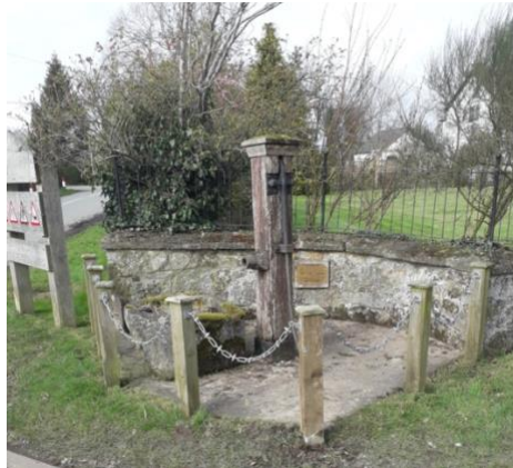
The old water pump at Aston Square

As a 'living' document this Strategic Plan will be reviewed by the Parish Council on a regular basis, at least annually, so that progress can be monitored. It will be updated as actions are completed and where progress is impeded the Council will consider what actions are necessary and whether further work or funding is required.